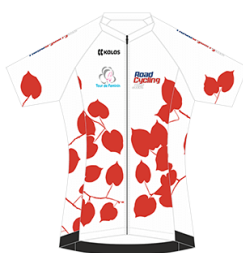
Leader of the mountain competition