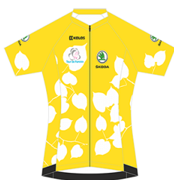
Leader of the general classification