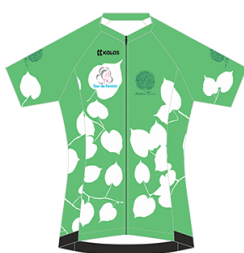
Leader of the points competition