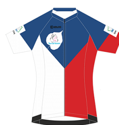
Leader of the best Czech rider competition